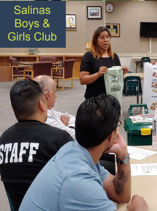
Salinas Boys & Girls Club