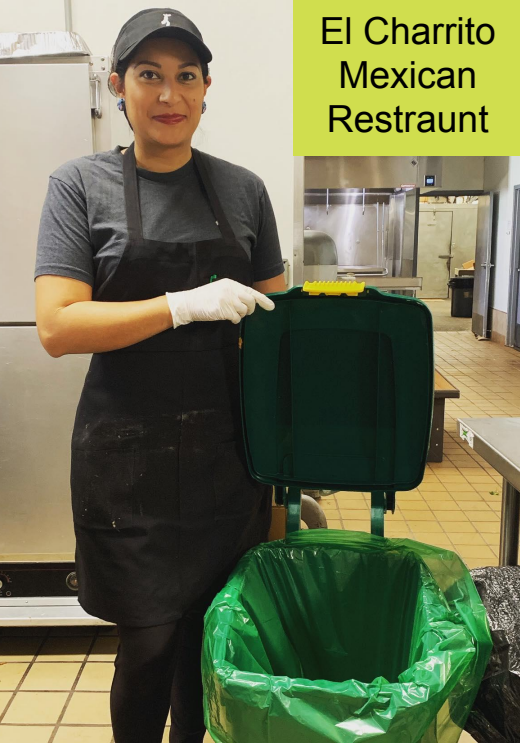
El Charrito Mexican Restraunt