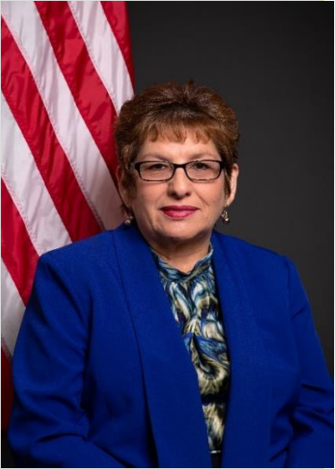
Maria Orozco, Mayor of Gonzales