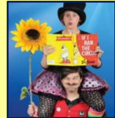
CIRCUS OF SMILES July 25 1:00pm