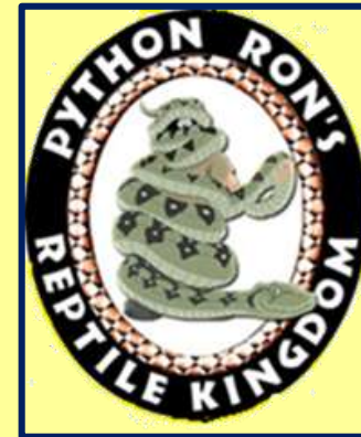
PYTHON RON'S REPTILE KINGDOM July 18 1:00pm