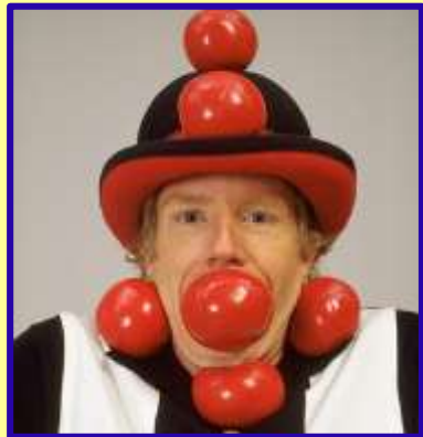
ROCK STEADY JUGGLING June 27 1:00pm