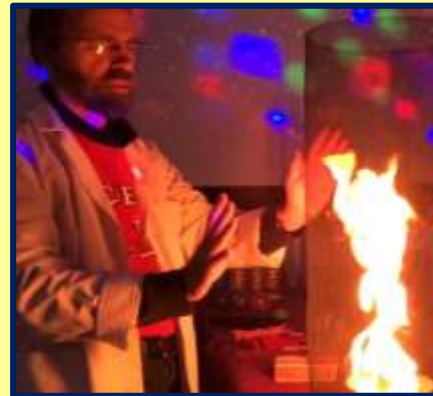
XTREME SCIENCE FUN July 11 1:00pm