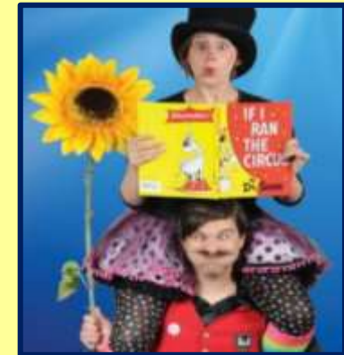
CIRCUS OF SMILES July 25 1:00pm